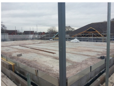
The First Floor

We have also been planning and completing the design of the roof trusses ready for the planned installation in early May.