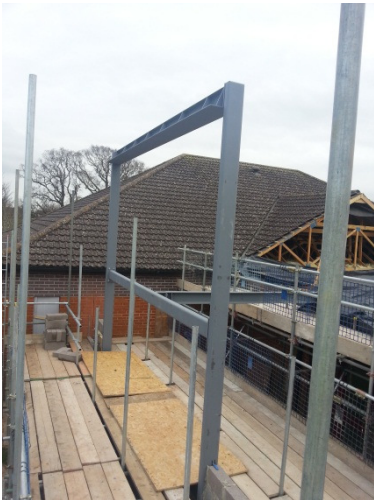
The Steel Frame for the new glazing to the staircase.