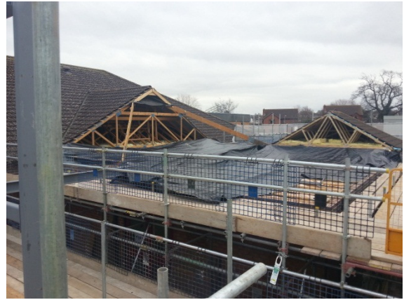
Roof removed from the existing school extension